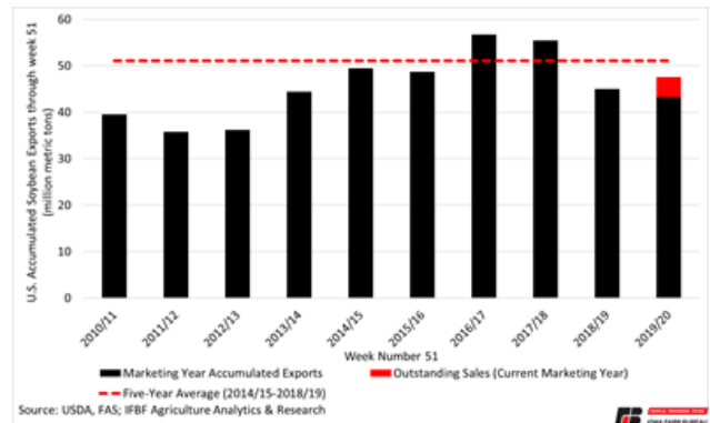
Figure 2: Soybeans reaching their prior 5-year average export volumes would provide a great boost to Iowa agriculture